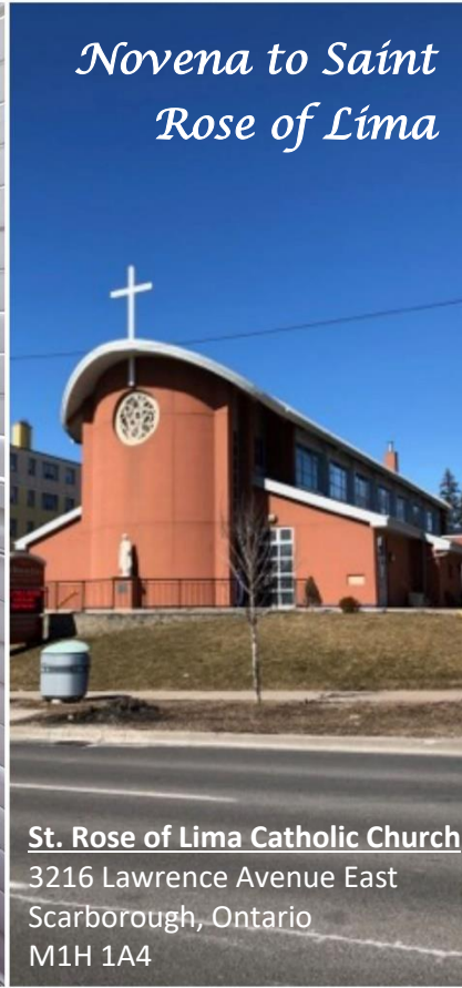
St. Rose of Lima Catholic Church 3216 Lawrence Avenue East Scarborough, Ontario M1H 1A4