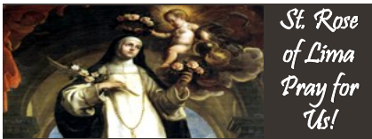
St. Rose of Lima Pray for Us!

But if you probe a little deeper, you'll find that they don't really want possessions. Rather, they desire a sense of fulfillment, a feeling of being loved and cherished.