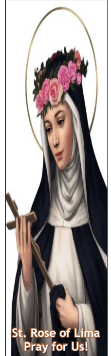
St. Rose of Lima Pray for Us!